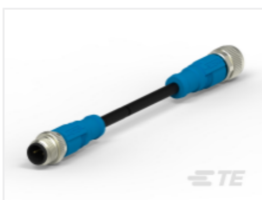
TE Part #CAT-SE594-M1NN M12 A-Code Male Straight to Female Straight Double Ended Cable