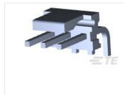
TE Part #640389-3 03P MTA156 HDR ASSY SQ R/A F/L