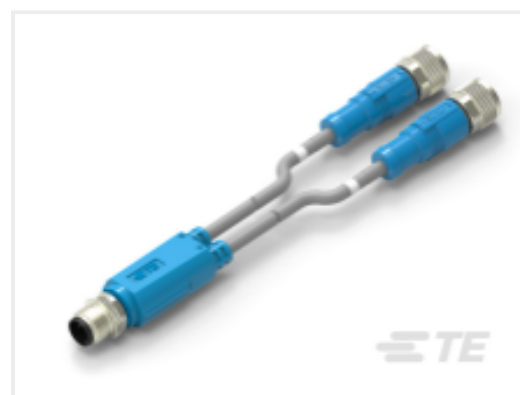
TE Part #T4153120024-993 RPC-M12Y2-4MS-0.3-2M12-3FS-PUR