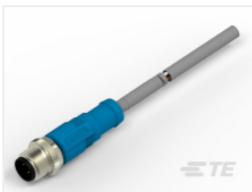
TE Part # T4151120004-005 RPC-M12-MS-4CON-PUR-5.0