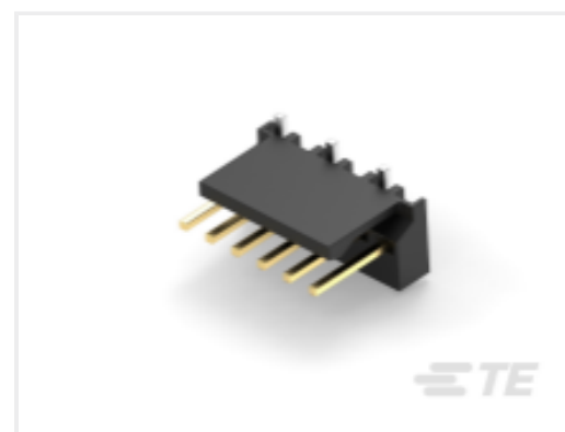
TE Part #CAT-104MTA-NVSMH PCB Header: Nylon, Vertical, Surface Mount, MTA 100