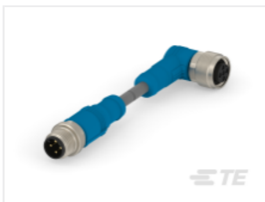
TE Part #T4152124004-002 RPC-M12-4MS-1.0-M12-4FR-PUR