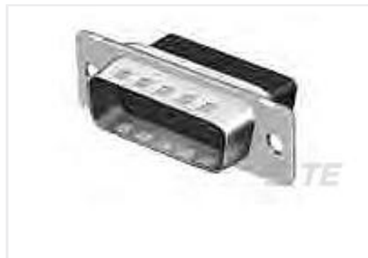
TE Part #205206-3 CRIMP SNAP PLUG ASSY, SIZE 2