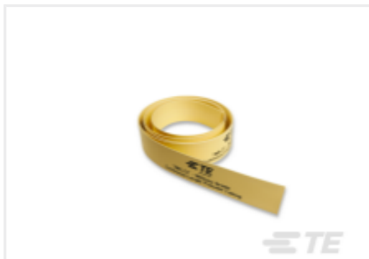
TE Part #CAT-C7679-T548 CONTINUOUS TUBE MILITARY GRADE TMS-CT