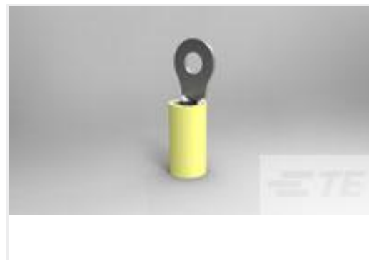
TE Part #696424-5 TERMINAL, PIDG PVF2 R 12-10 8