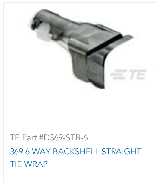
TE Part #D369-STB-6 369 6 WAY BACKSHELL STRAIGHT TIE WRAP