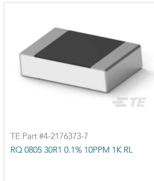
TE Part #4-2176373-7 RQ 0805 30R1 0.1% 10PPM 1K RL