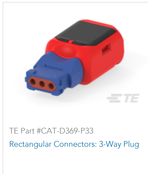
TE Part #CAT-D369-P33 Rectangular Connectors: 3-Way Plug