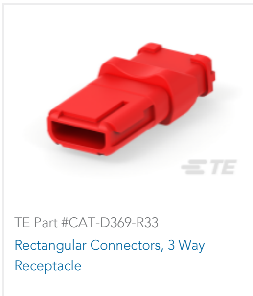
TE Part #CAT-D369-R33 Rectangular Connectors, 3 Way Receptacle