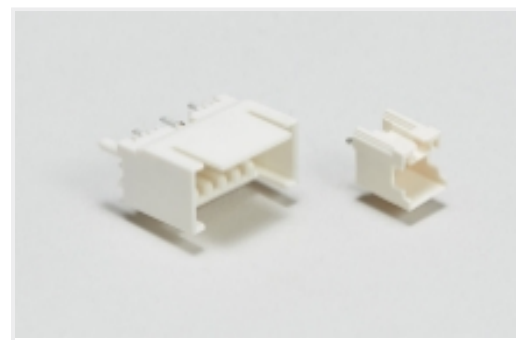
Wire-to-Board Headers & Receptacles (91)