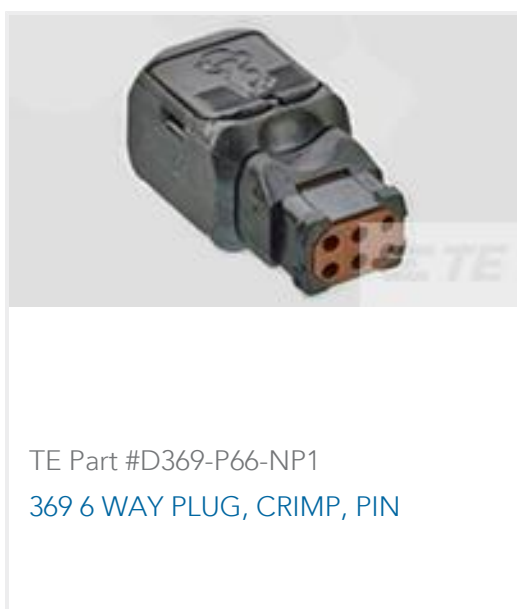
TE Part #D369-P66-NP1 369 6 WAY PLUG, CRIMP, PIN