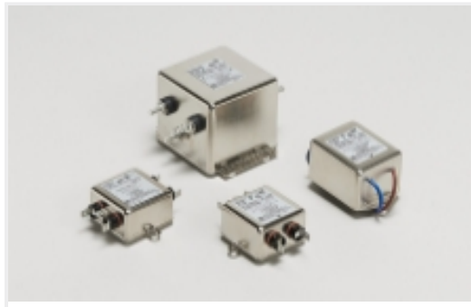
Single Phase Filters(4)