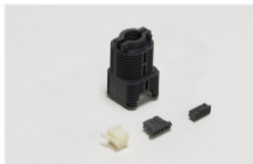
Rectangular Connector Housings(1)