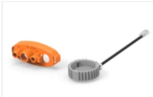
Connector Caps & Covers(69)