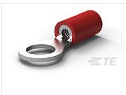
TE Part #130014 TERM, R, PG, 22-16, M5