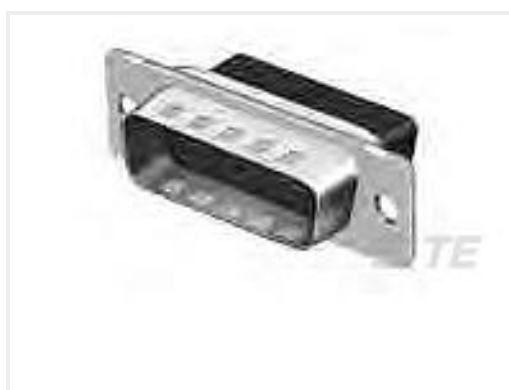
TE Part #5205208-1 CRIMP SNAP PLUG ASSY, 25 POS