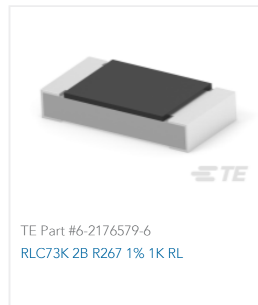
TE Part #6-2176579-6 RLC73K 2B R267 1% 1K RL