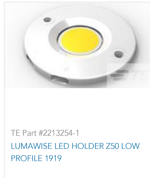
TE Part #2213254-1 LUMAWISE LED HOLDER Z50 LOW PROFILE 1919