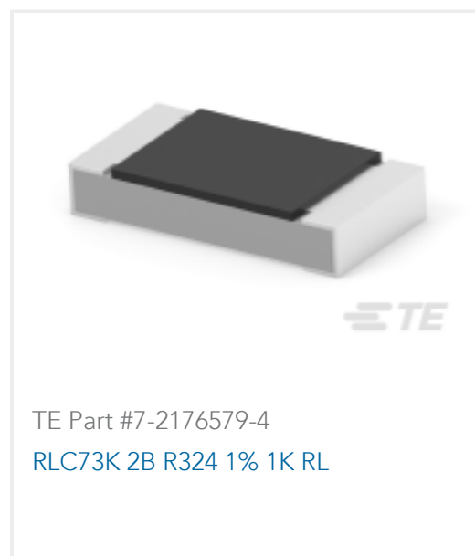
TE Part #7-2176579-4 RLC73K 2B R324 1% 1K RL