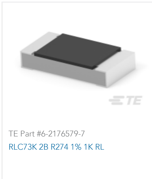
TE Part #6-2176579-7 RLC73K 2B R274 1% 1K RL