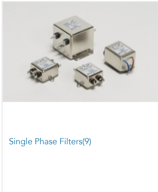
Single Phase Filters(9)