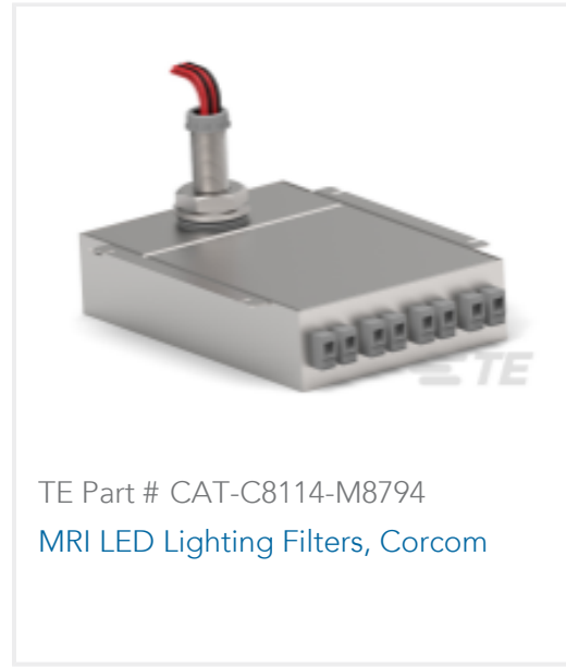
TE Part # CAT-C8114-M8794 MRI LED Lighting Filters, Corcom