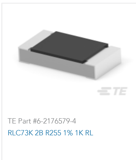
TE Part #6-2176579-4 RLC73K 2B R255 1% 1K RL