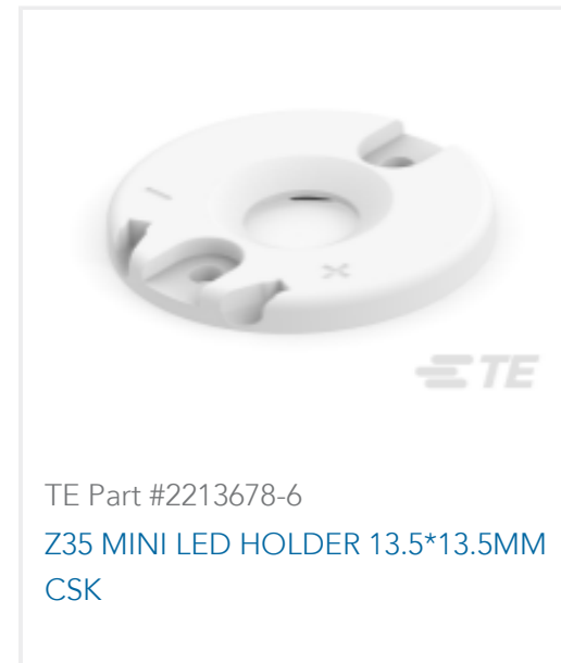
TE Part #2213678-6 Z35 MINI LED HOLDER 13.5*13.5MM CSK