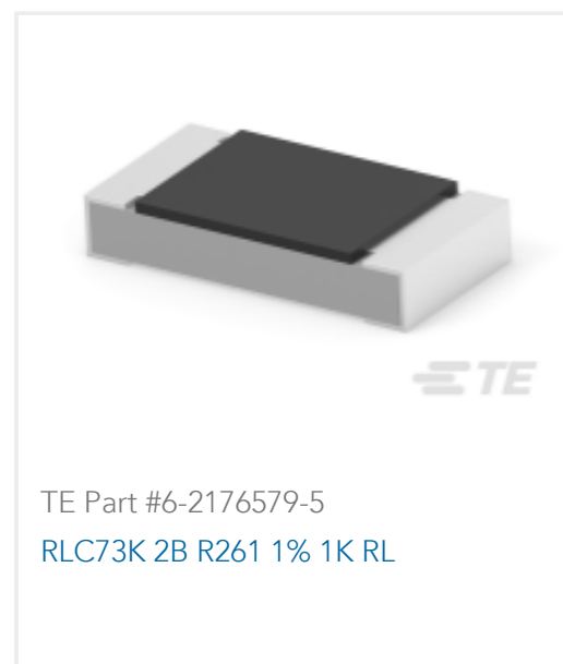
TE Part #6-2176579-5 RLC73K 2B R261 1% 1K RL