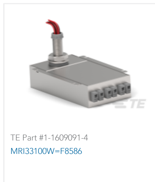
TE Part #1-1609091-4 MRI33100W=F8586