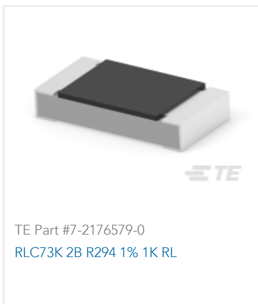
TE Part #7-2176579-0 RLC73K 2B R294 1% 1K RL