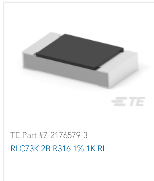
TE Part #7-2176579-3 RLC73K 2B R316 1% 1K RL