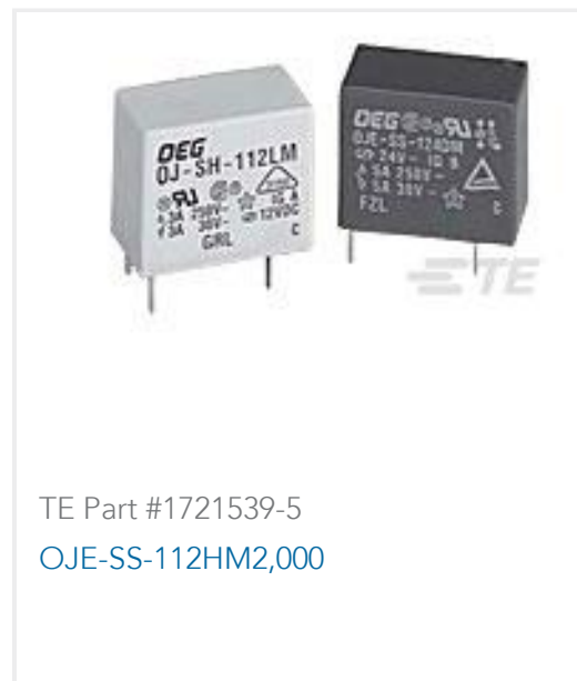
TE Part #1721539-5 OJE-SS-112HM2,000