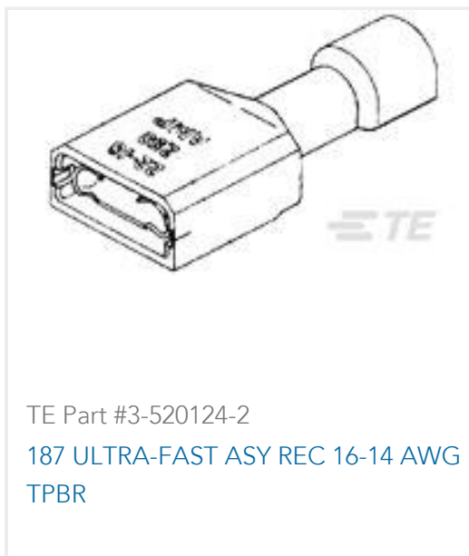
TE Part #3-520124-2 187 ULTRA-FAST ASY REC 16-14 AWG TPBR