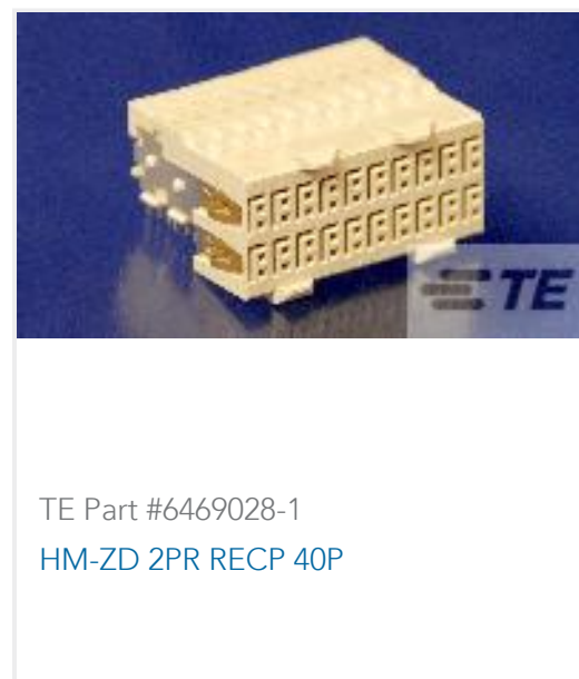
TE Part #6469028-1 HM-ZD 2PR RECP 40P