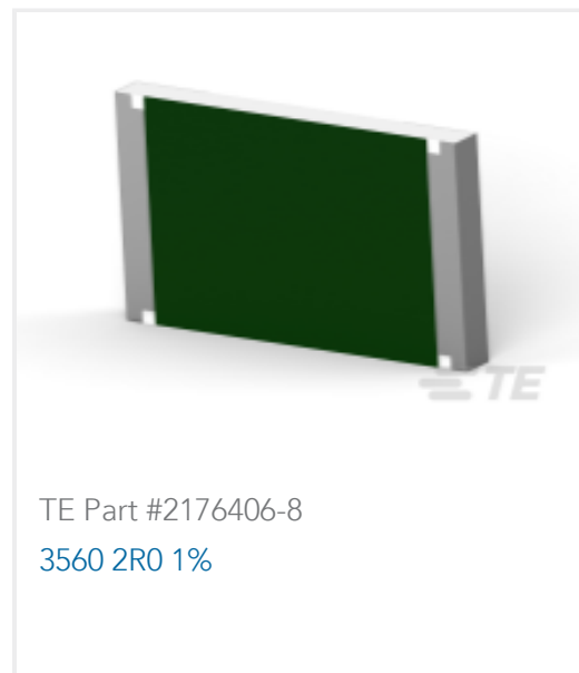
TE Part #2176406-8 3560 2R0 1%