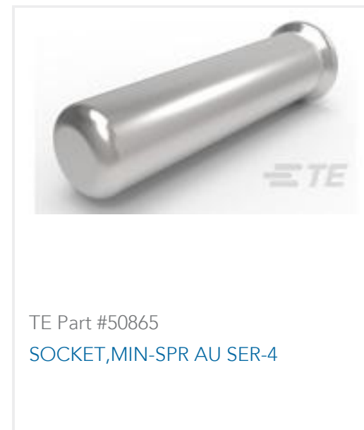
TE Part #50865 SOCKET,MIN-SPR AU SER-4