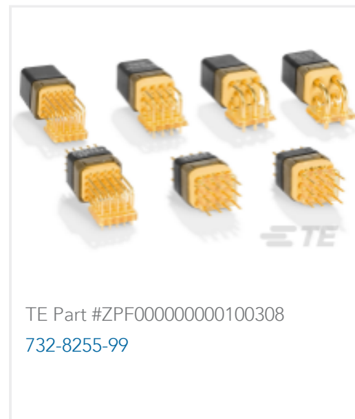
TE Part #ZPF000000000100308 732-8255-99