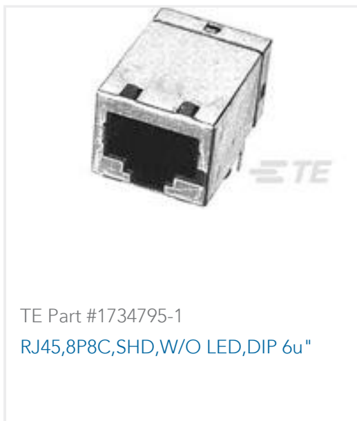
TE Part #1734795-1 RJ45,8P8C,SHD,W/O LED,DIP 6u"