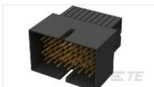
TE Part #2102081-2 Fortis Zd 2Pr 10Col R/A Full Shroud Assy