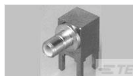
TE Part #5414337-1 JACK,RTANG,SMB/PCB