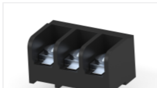
TE Part #5-1546686-6 6PCV-03-006=6PCV Assy w/ Captive Screws