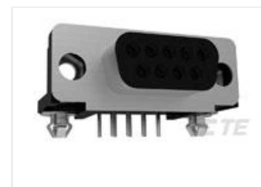
TE Part #5747844-4 09 MSFL RCPT RA 318 (IN,FM,BL)