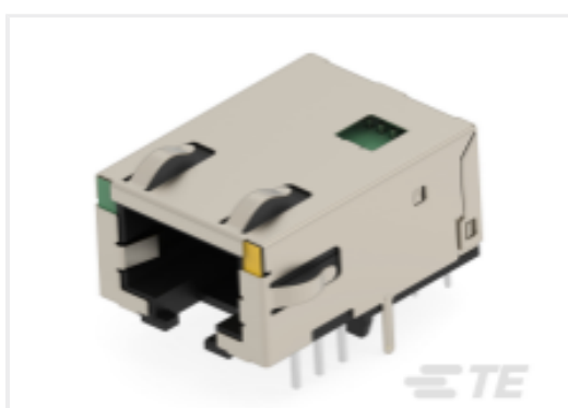
TE Part #2489079-1 RJ45 W/MAGNET 1X1 10G LED PLATING T 50