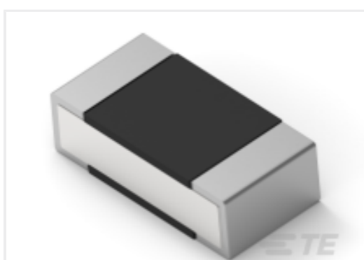
TE Part #9-2176312-2 RP 1E 0.1W 110K 0.1% 25PPM 1K RL