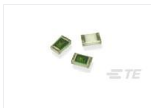
TE Part #7-1879128-6 RN 0402 1K0 0.1% 10PPM CUT LENGTH