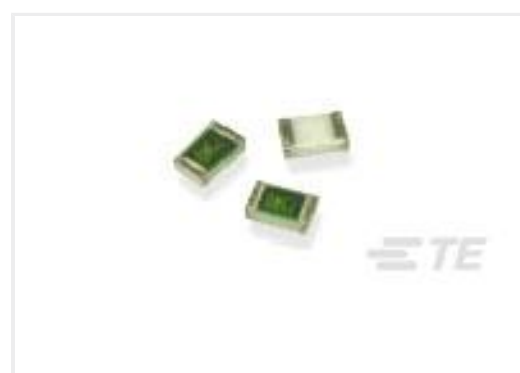
TE Part #1676220-1 RN 0805 1K07 0.1% 10PPM CUT LE