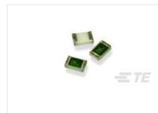
TE Part #3-1879336-1 CPF 0603 475R 1% 50PPM 1K RL