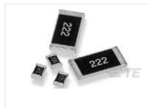
TE Part #4-2176186-6 CRGH1206 1% 680K 0.5W