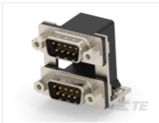
TE Part #2454917-4 D-SUB ,9 POS PLUG OVER 9 POS PLUG + SC