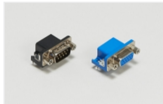
PCB D-Sub Connectors(9)