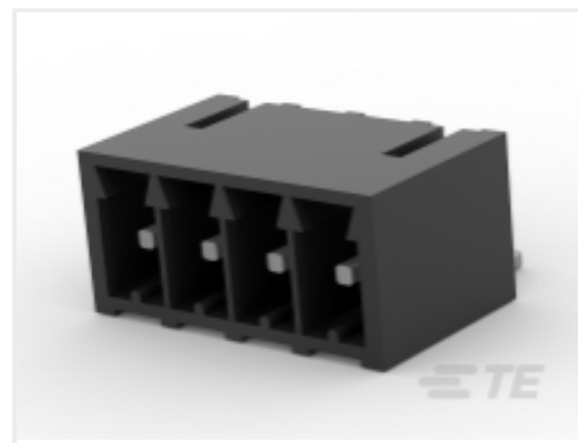
TE Part #2213932-4 SMT TB R/A HEADER, 3.5MM, 4 POS