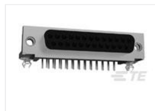
TE Part #5747846-4 25 MSFL RCPT RA 318 (IN,FM,BL)