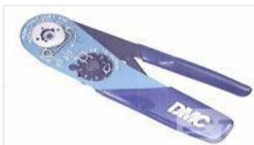
TE Part # 601966-1 CRIMPING TOOL M22520/2-01