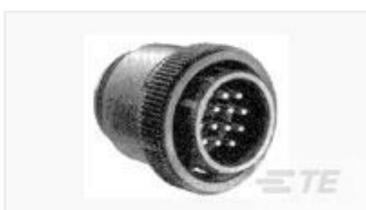
TE Part #206305-1 CPC PLUG ASSEMBLY SIZE 23-37