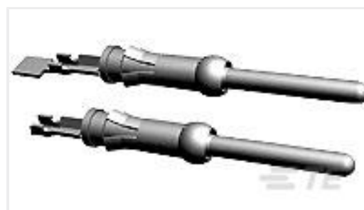
TE Part #1-66099-5 III+ PIN,18-16,TIN ,LP