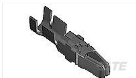
TE Part #66740-8 TYPE XII FEMALE CONT (L.P.)