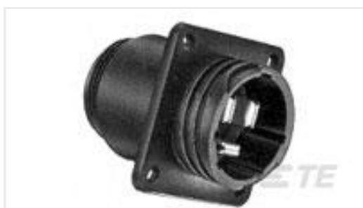
TE Part #206227-1 23-7 RECEPT REV SEX