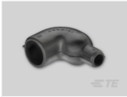
TE Part #CAT-R21-73106549 Bulbous Heat Shrink Boots: Lipped, Right Angle