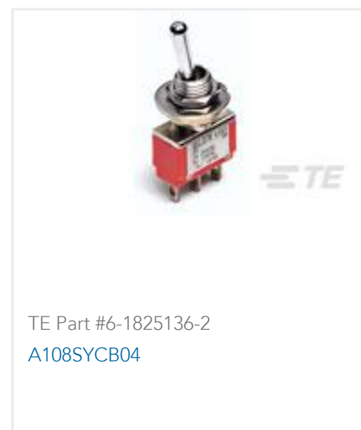
TE Part #6-1825136-2 A108SYCB04