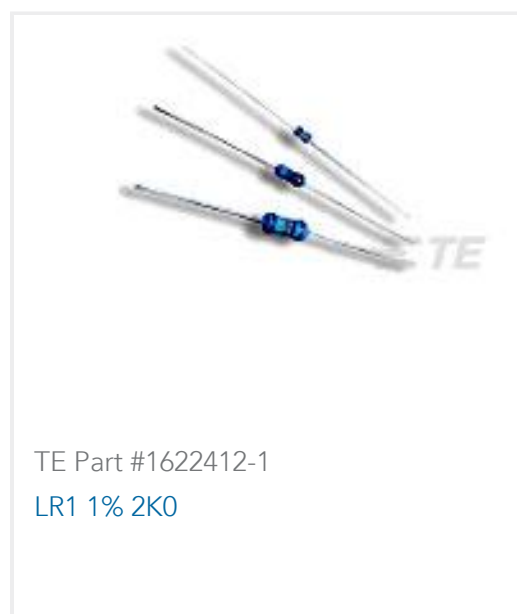
TE Part #1622412-1 LR1 1% 2K0