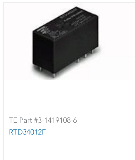
TE Part #3-1419108-6 RTD34012F