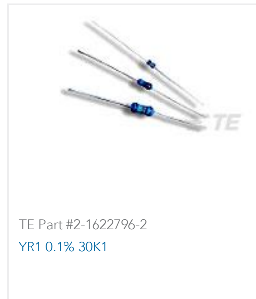
TE Part #2-1622796-2 YR1 0.1% 30K1