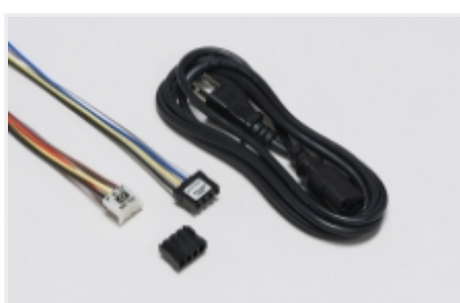
EMI & EMC Accessories(1)