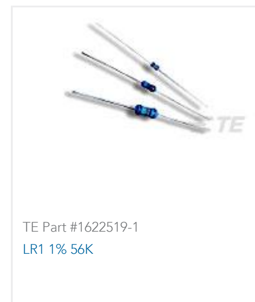
TE Part #1622519-1 LR1 1% 56K