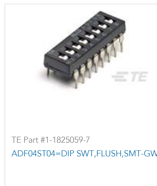
TE Part #1-1825059-7 ADF04ST04=DIP SWT,FLUSH,SMT-GW