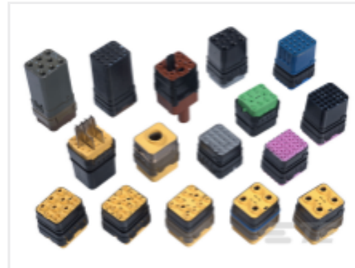
TE Part #ZPF000000000148762 DMC-M 99-04 AN (=33537-P0000)