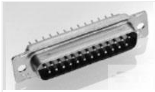
TE Part #205162-6 AMPLIMITE,ASY,PLUG,109,1