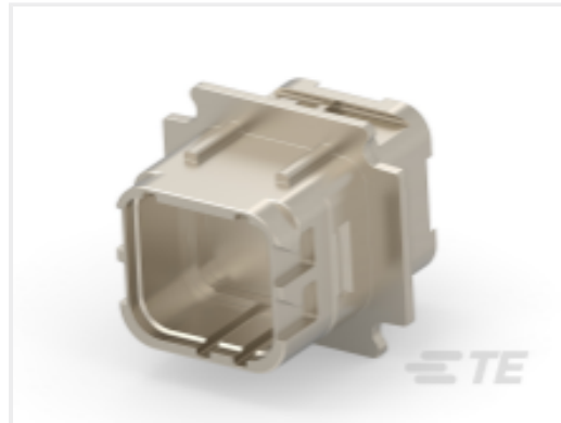
TE Part #CAT-DMC-MD-26 Rectangular Connector Receptacle Extenders, Tool-less Assembly