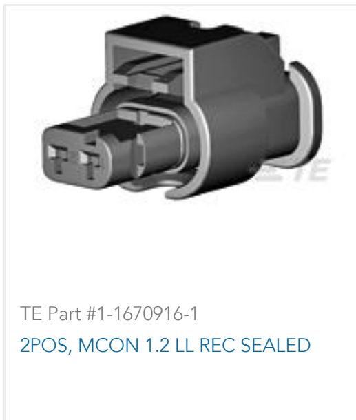
TE Part #1-1670916-1 2POS, MCON 1.2 LL REC SEALED