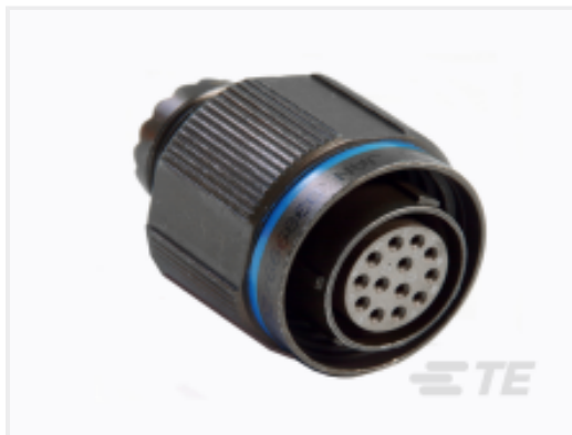
TE Part #YDTS26Z21-41PNV001 PLUG ASSY