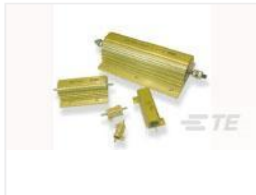
TE Part #2-1630027-9 HSC300 15R 5%