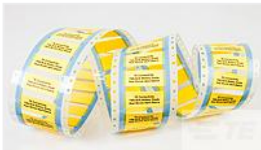
TE Part #7677230001 TMS-SCE-1K-2-2.0-9