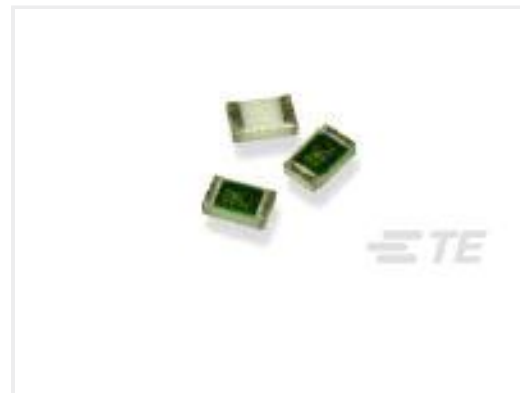
TE Part #2-1614885-7 CPF 0805 910K 0.1% 25PPM 1K RL