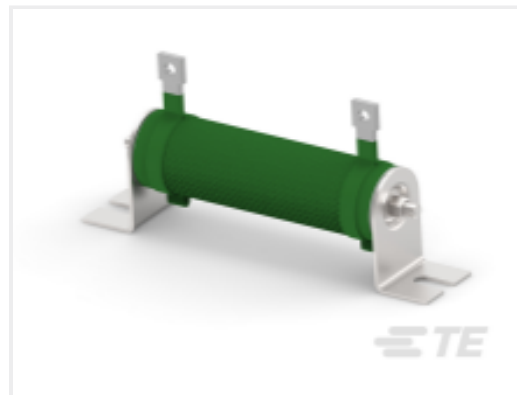
TE Part #CAT-C339-T2201 Wirewound Resistor: Mineral, 2.5 Kw