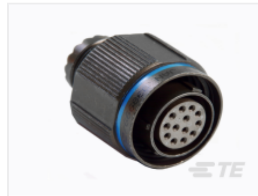
TE Part #CAT-D38999-DTS25D D38999: Straight Plug, 11-98 Insert