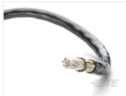
TE Part #8163673001 VG-95218-T025-G004