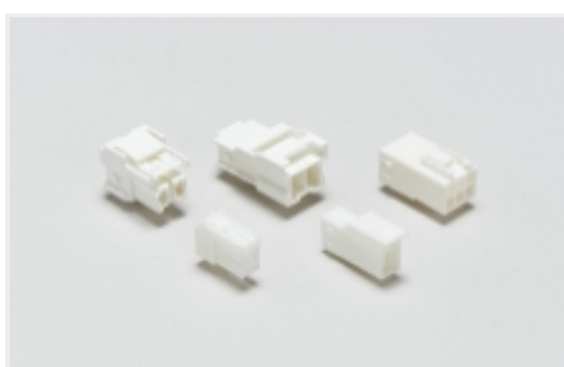
Rectangular Power Connectors(3)