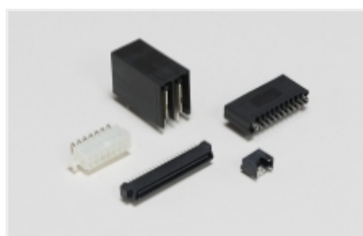
Standard Rectangular Connectors(3)