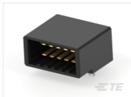
TE Part #CAT-D9934-A75E Header Assembly: Wire-to-Board, 15A, gold or tin plated