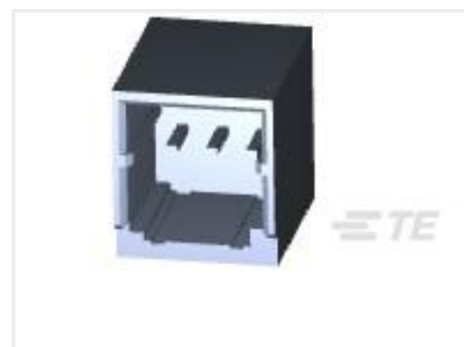
TE Part #2-1827875-3 DYNAMIC 1200D HDR ASSY V 6P Y BLACK GOLD