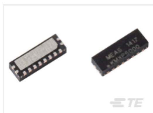
TE Part #G-MRCC-052 5MM PITCH AMR POSITION SENSOR KMP