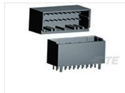
TE Part #1-2040516-5 DYNAMIC 1100D HDR ASSY V 10PX BLACK GOLD