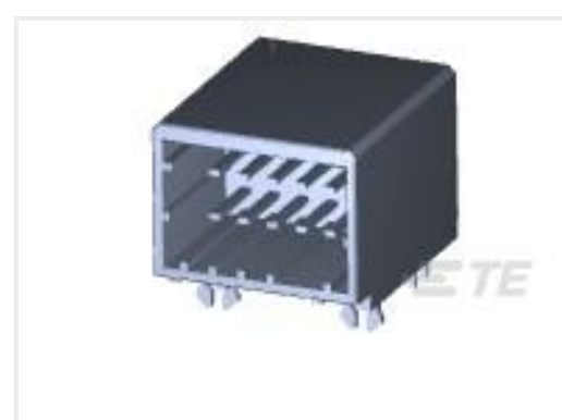
TE Part #1376020-2 DYNAMIC D2100 HDR H ASSY 12P Y BLACK