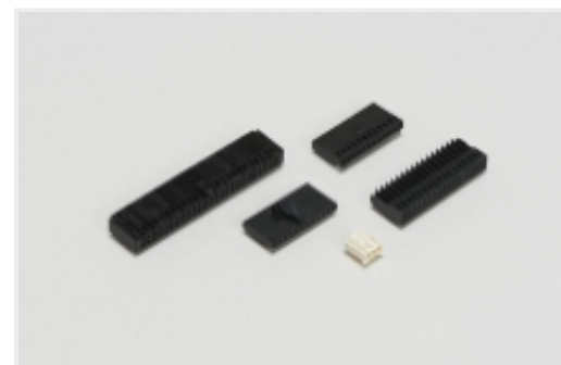
Wire-to-Board Connector Assemblies &amp; Housings(24)