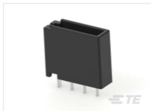
TE Part #CAT-D9934-A15G Header Assembly: Wire-to-Board, 5A, Gold Plated