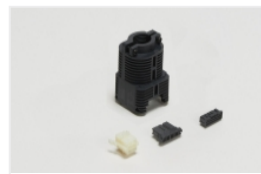
Rectangular Connector Housings(129)