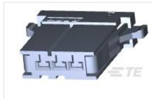
TE Part #1-178288-3 DYNAMIC DD3100 REC HSG 3P (SGL)