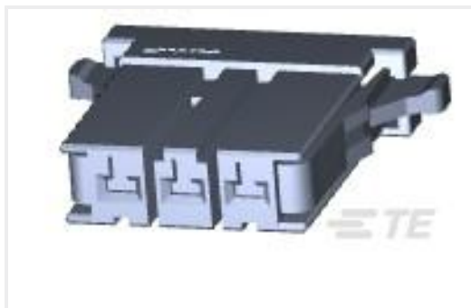
TE Part #3-178128-3 DYNAMIC D3200 REC HSG 3P SGL Z