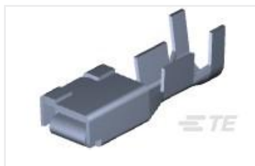
TE Part #316041-2 DYNAMIC D-5 REC CONT. M L/P