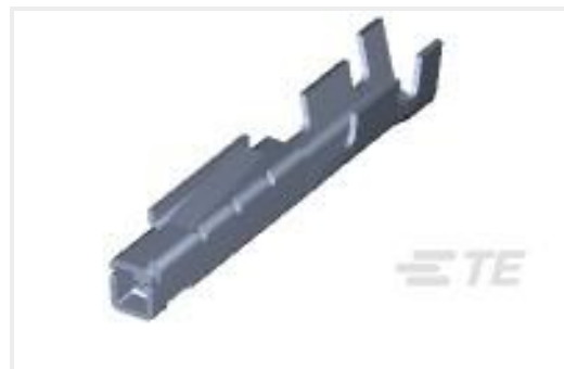
TE Part #1318107-1 DYNAMIC D-2000 REC CONT M L/P