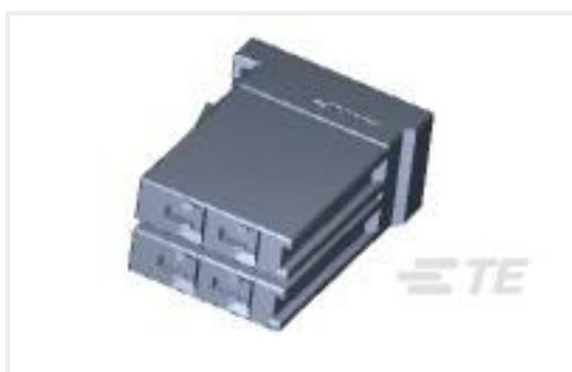
TE Part #175363-2 DYNAMIC D-3500 REC HSG 4P