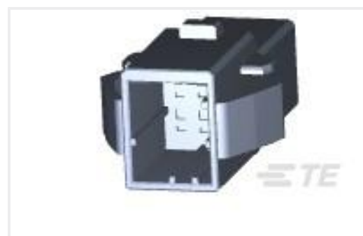
TE Part #1-1318114-3 DYNAMIC D-2100 TAB HSG 6P P/M