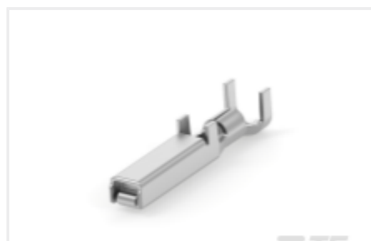
TE Part #CAT-D9934-A75 Contact: Component To Wire; 15A, 28-14 wire size