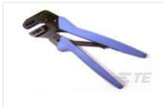
TE Part #58571-1 PROCIMP TL W/DIE DYN3RH