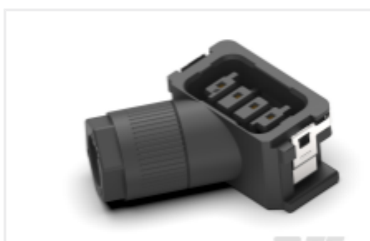
TE Part #2314083-2 KIT, REC CONN W CON, RA MMC-PO-P-F90