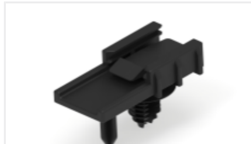
TE Part #1011-310-0205 CLIP, PA66, BLK, FIR-TREE, ST