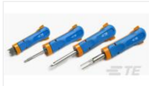
TE Part #9-1579007-1 EXTRACTION TOOL