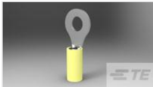
TE Part #35110 TERM, RT, PIDG, 12-10, 1/4