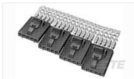
TE Part #5-103957-7 2X8 MTE RCPT SR LATCH .100CL