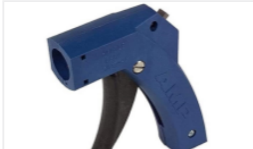
TE Part # 58074-1 MTA 50/100/156 MANUAL TOOL FRAME