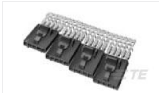
TE Part #1-103644-5 16 MTE RCPT SR LATCH .100CL