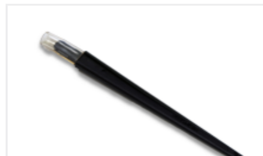
TE Part # 843477-1 TOOL, EXTRACTION RESET