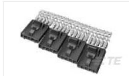
TE Part #1-103644-2 13 MTE RCPT SR LATCH .100CL