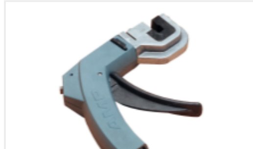
TE Part # 58336-1 HEAD (IDC) MODU MTE WITHOUT TOOL FRAME