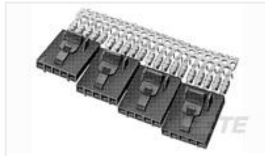
TE Part #5-103960-5 4X6 MTE RCPT SR LATCH .100CL