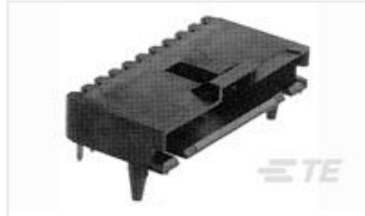
TE Part # 1-104361-1 12 MTE HDR SRRA LATCH W/HLDWN