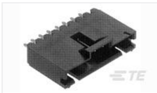
TE Part # 1-103638-1 12 MTE HDR SRST LATCH .100CL