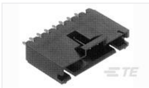
TE Part #103670-7 08 MTE HDR SRST LATCH W/HLDWN