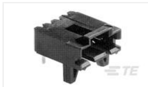
TE Part # 1-103673-1 12 MTE HDR SRRA LATCH W/HLDWN