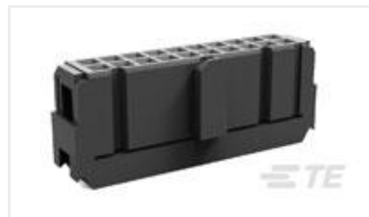
TE Part #1658621-2 14 NOVO MIL/CTR 15DP, LEAD FREE