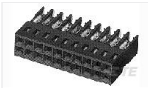
TE Part #6-102448-8 40 AMPMODU MT ASSY DR.100CL SN