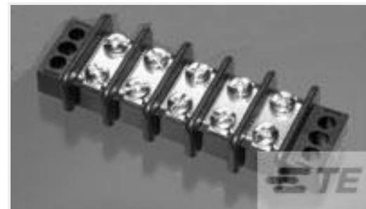
TE Part #1546307-2 2P .374" DR BARRIER, W/WASHER