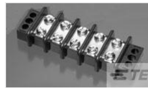
TE Part #1546307-4 4P .374" DR BARRIER, W/WASHER