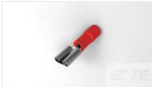
TE Part #640903-1 RECEPT, PIDG FASTON 22-18 250