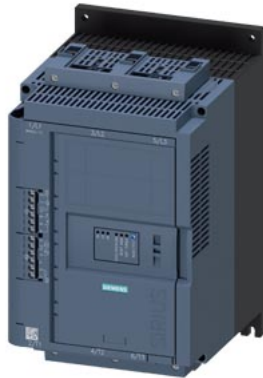
SIRIUS soft starter 200-600 V 63 A, 24 V AC/DC Screw terminals Thermistor input